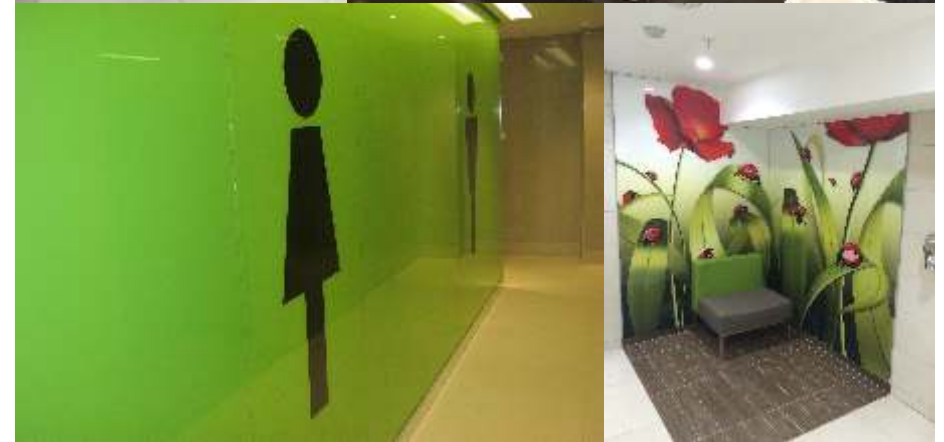
Bottom Left: Samsung Head Office, Bathroom entrance.