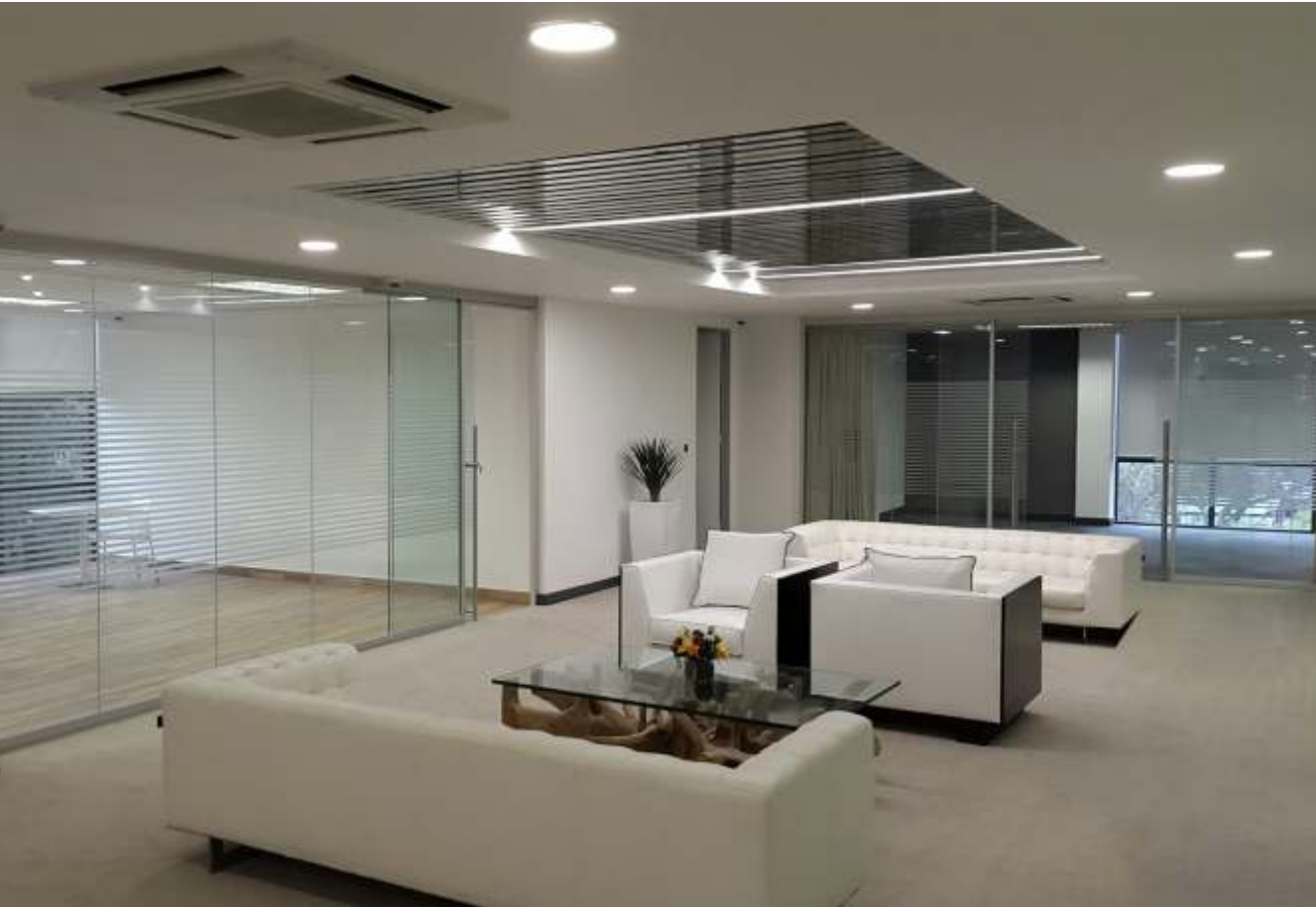
Top: Huawei offices, SiDiO 1 sliding door installation.