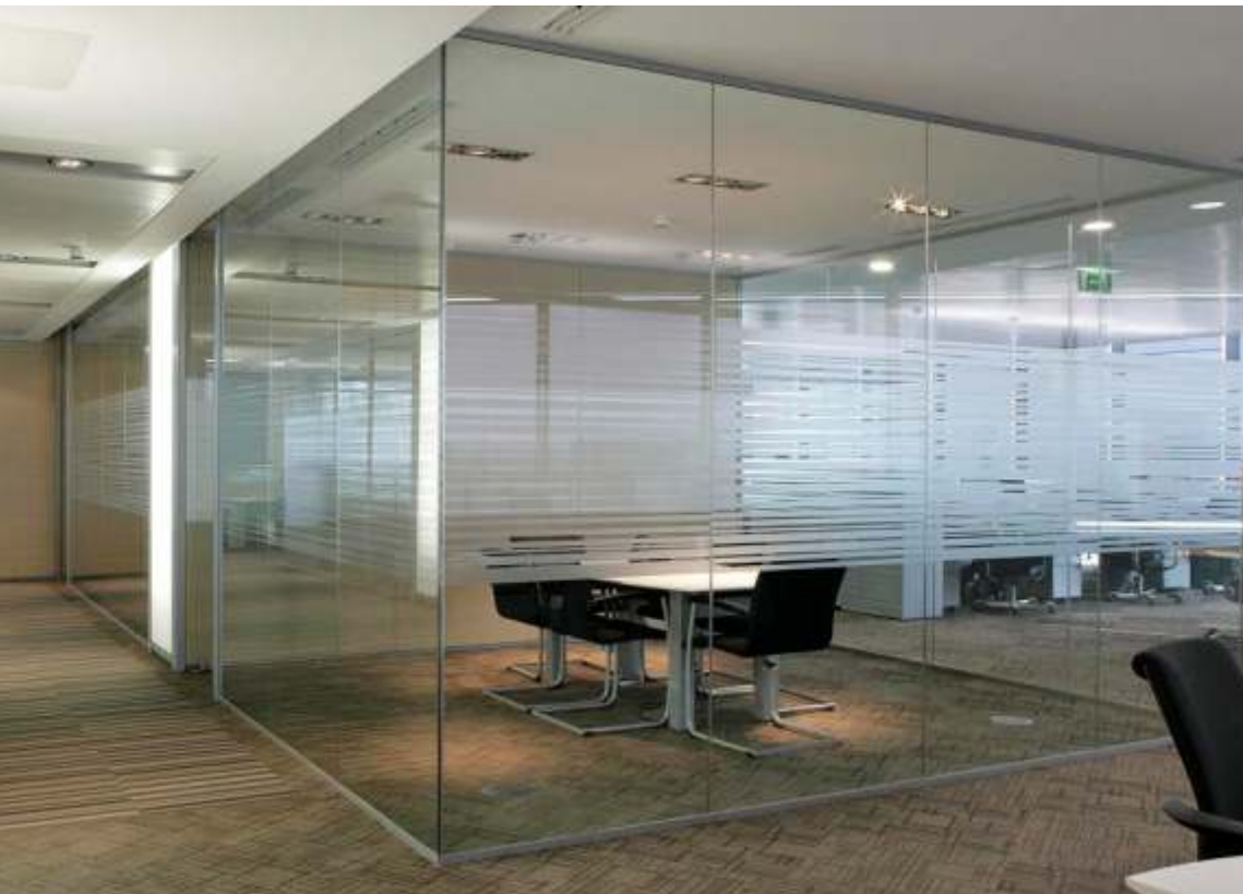
Bottom Left: Glass Fish Bowl.