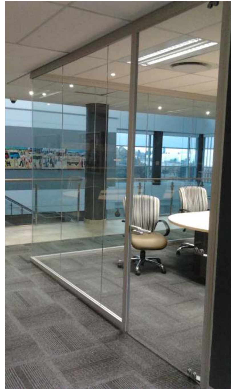
Right: Gautrain Midrand offices, SiDiO 1 hinged door installation.