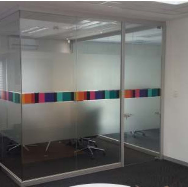
Top Left: Mace meeting Room.