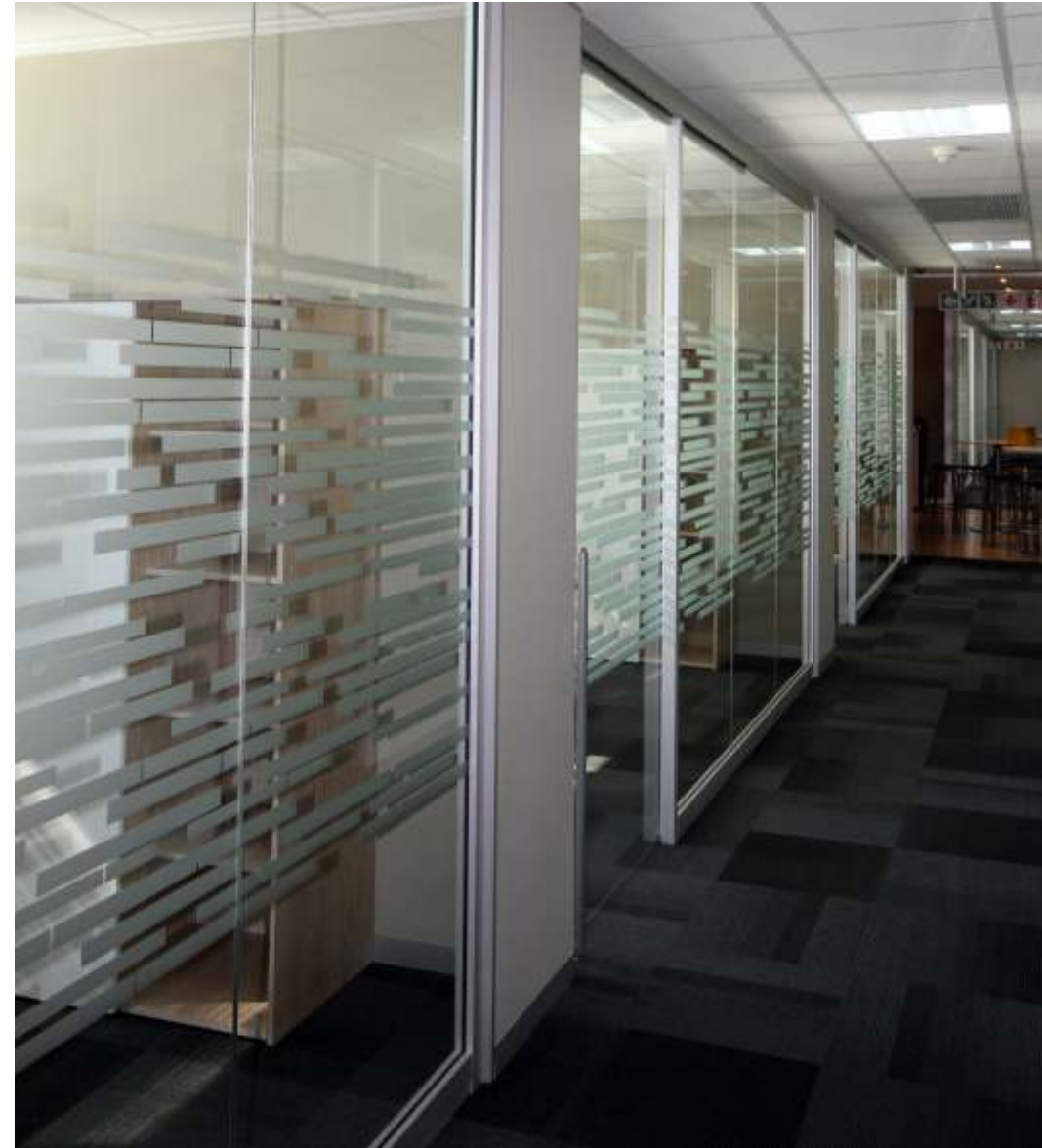
Bottom Right: Goldfields offices.