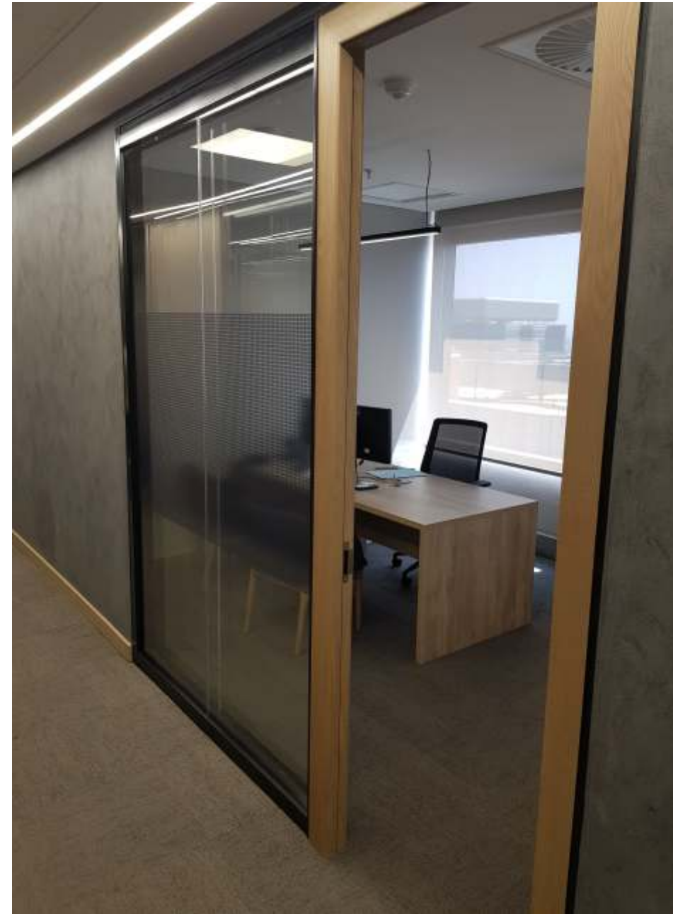
Top: Allen and Overy, Double Glazing.