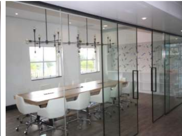
Left: Discovery Store, patch fitting doors with a glass toplight.