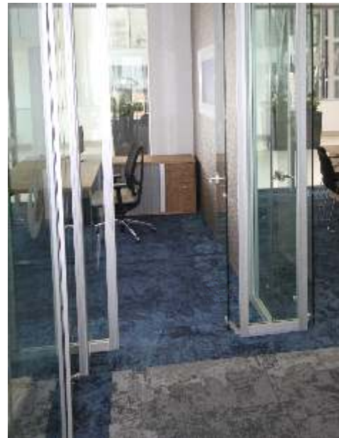
Top Middle: Eutelsat, multiple junctions.